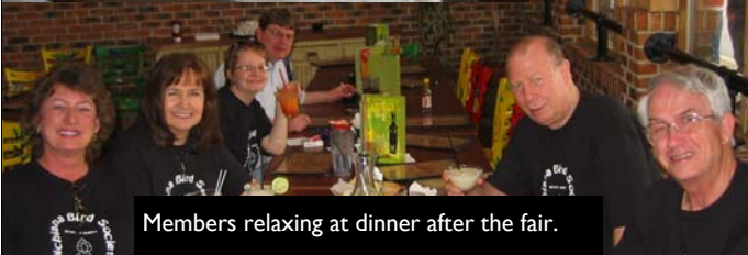
Members relaxing at dinner after the fair.